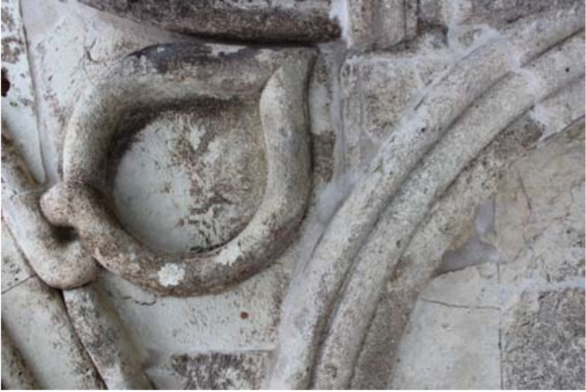
North façade of the Church of the Virgin at Gelati Monastery