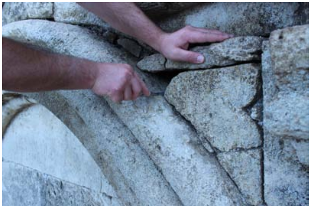
North façade of the Church of the Virgin at Gelati Monastery