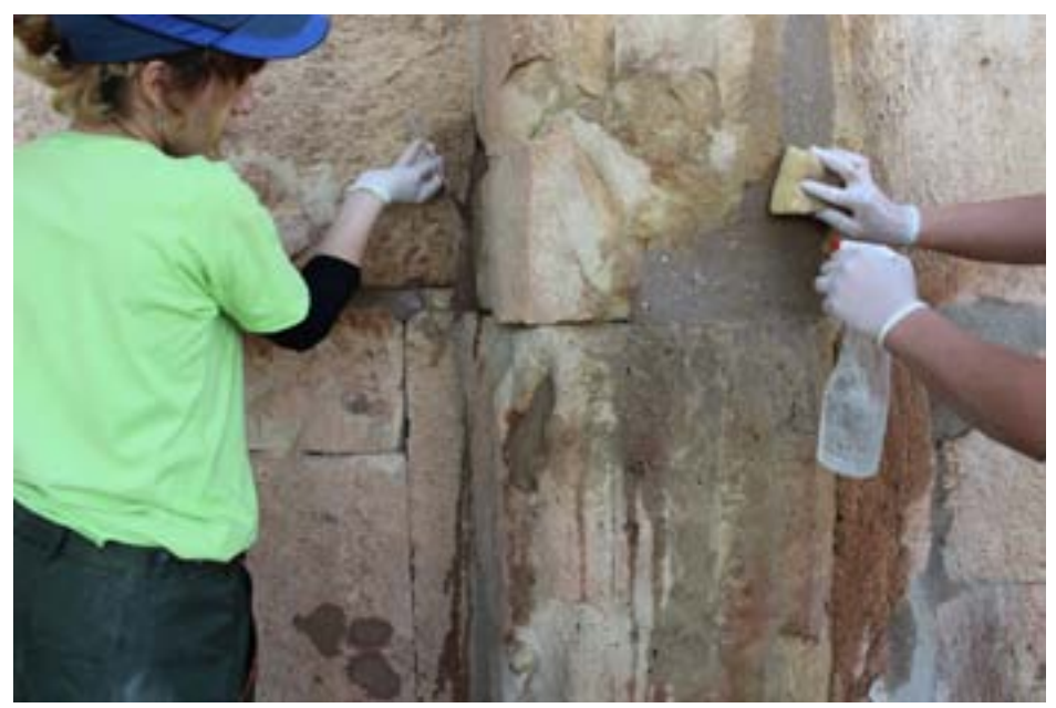
South of the Church of the Virgin at Gelati Monastery