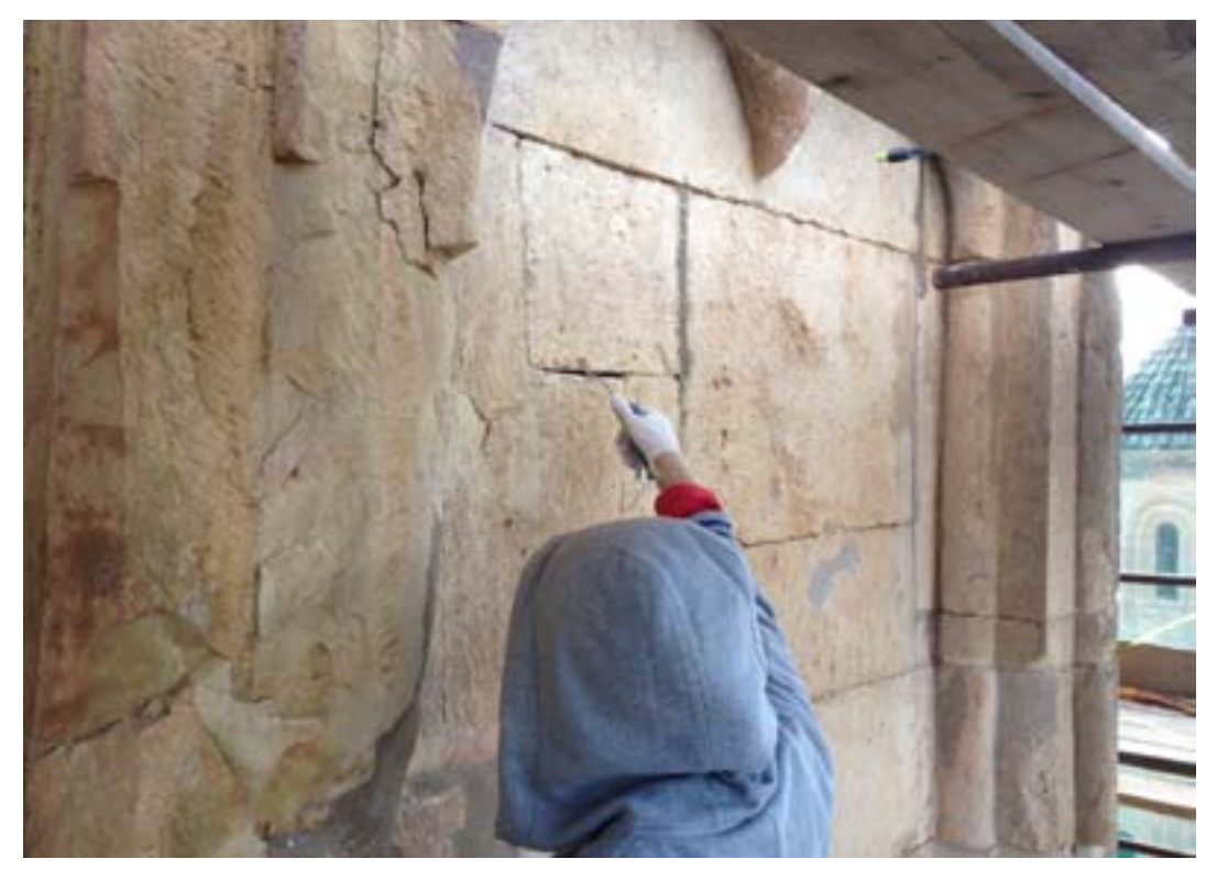
Cleaning of spaces between the stones