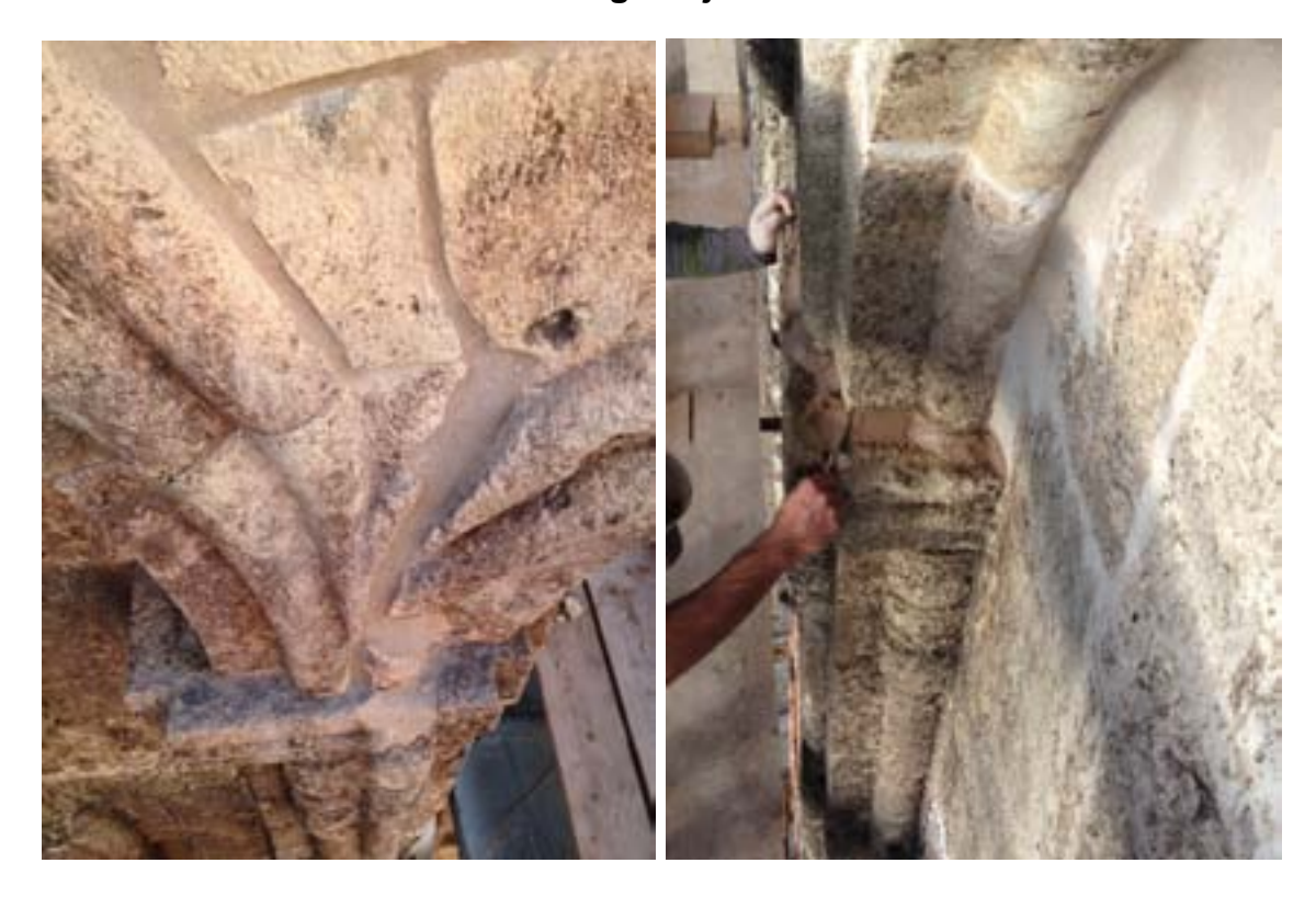
Filling the joints

Western facade of the Church of the Virgin at Gelati Monastery