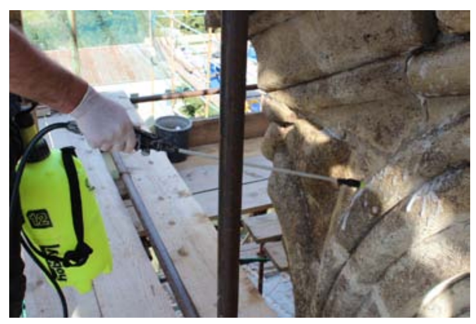
West façade of the Church of the Virgin at Gelati Monastery