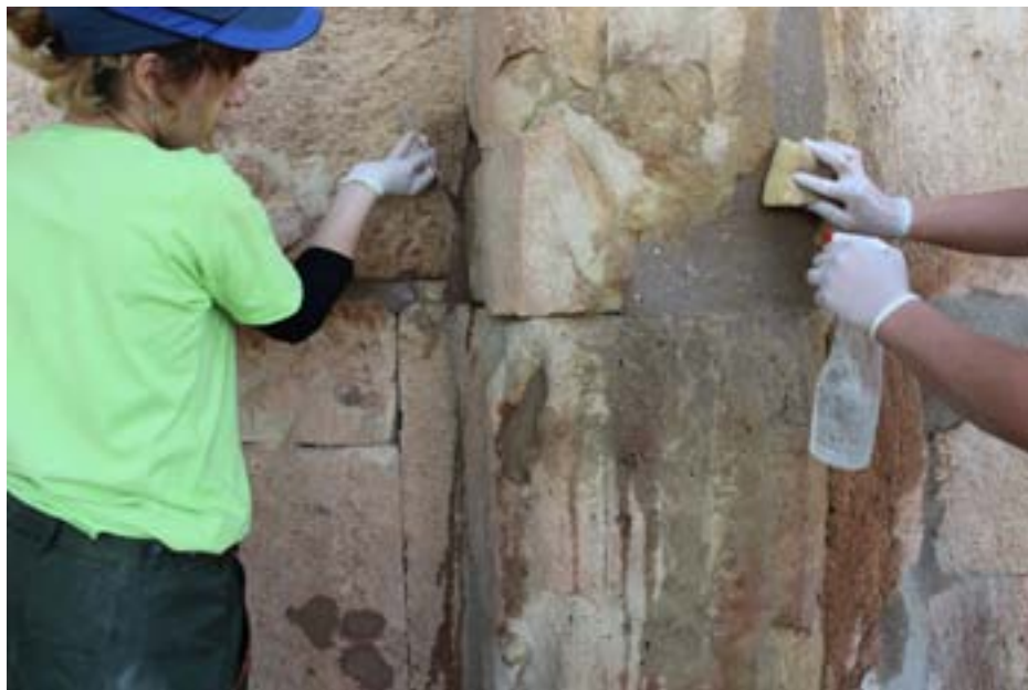
South of the Church of the Virgin at Gelati Monastery