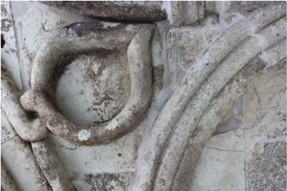
North façade of the Church of the Virgin at Gelati Monastery