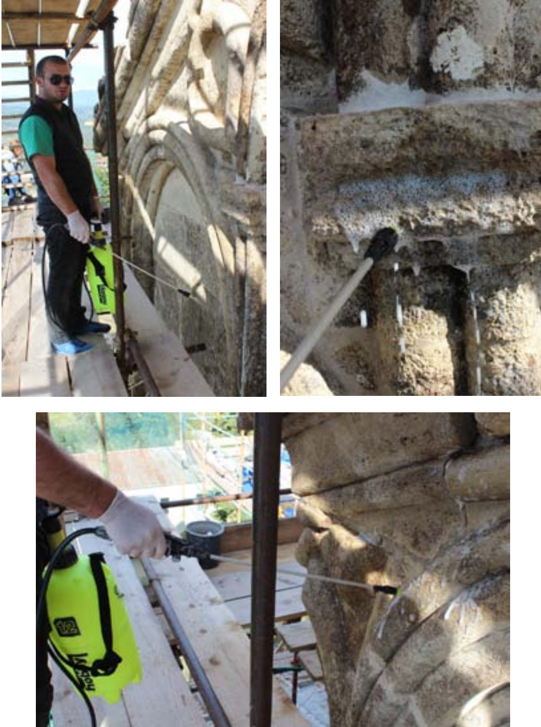
West façade of the Church of the Virgin at Gelati Monastery