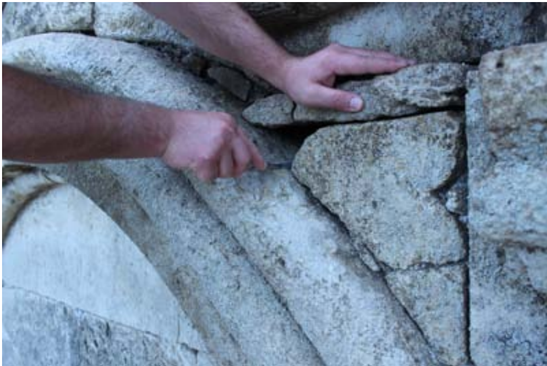
North façade of the Church of the Virgin at Gelati Monastery