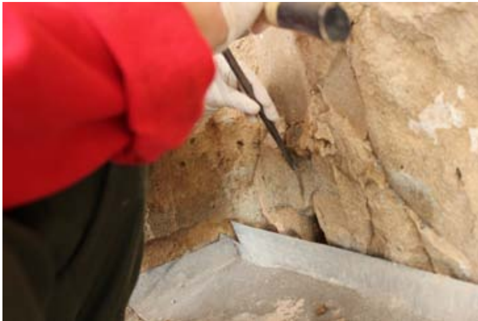
South façade of the Church of the Virgin at Gelati Monastery