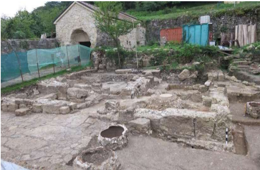
Recently excavated archaeological object, next to the St. George church