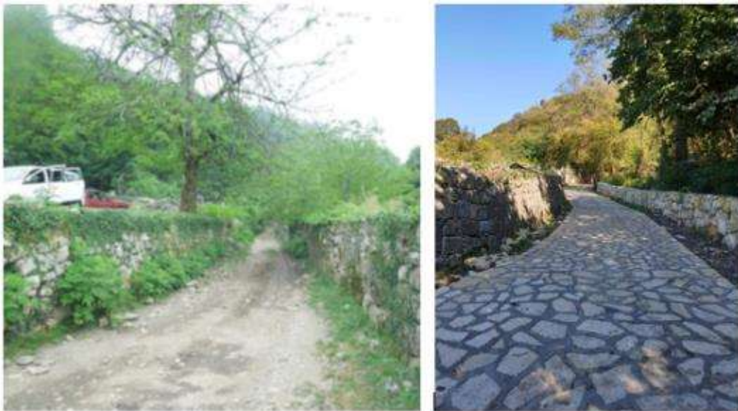
Old pathway, left photo: 2015, right: photo 2019