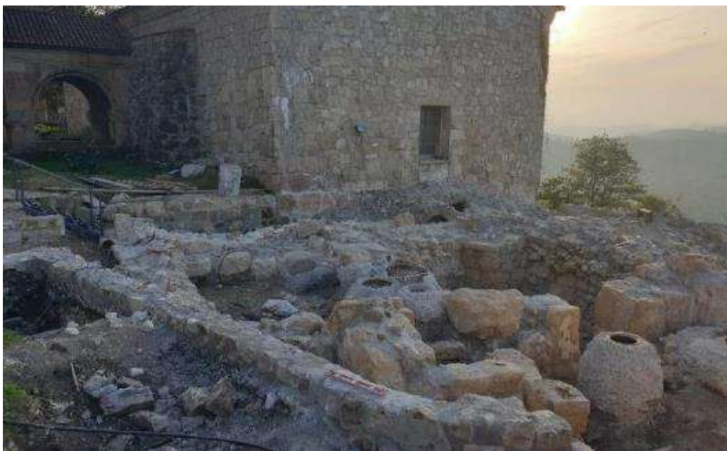
Excavated cellar areas next to the Academy