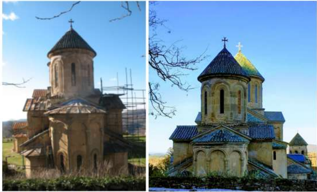
St. George Church, left photo: 2015, right photo: 2019