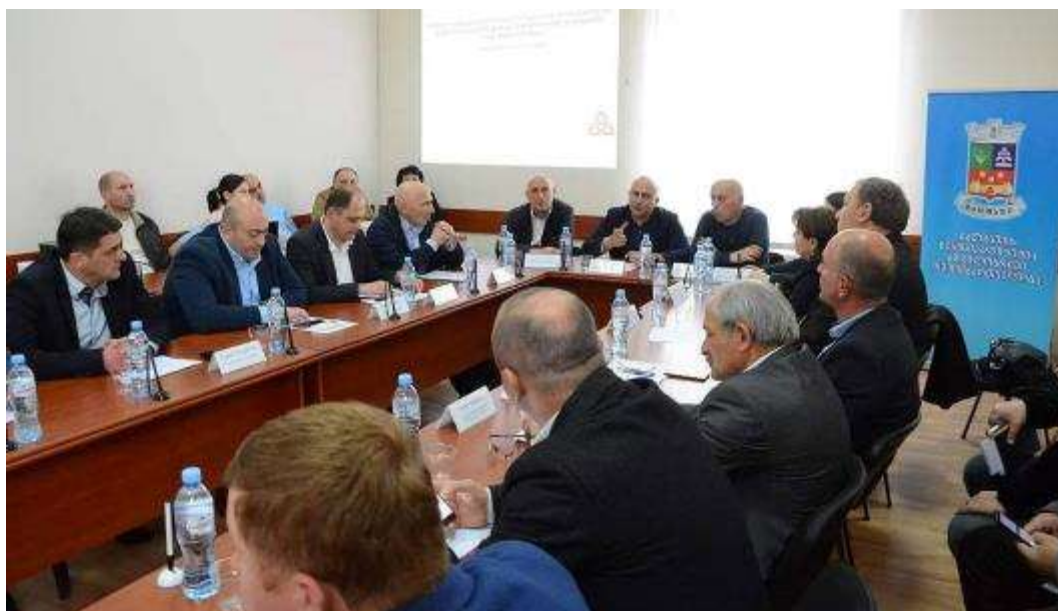
NACHPG meeting with the local authorities

Based on the lessons learned as a result of the Cultural Heritage Advisory Service by UNESCO to Georgia 2015-2017 within the World Bank RDPIII, mainly, the experience gained towards the Capacity Building activities for improving the professional abilities of all related local Authorities, mainly in the direction of the implementation of the World Heritage Convention, the periodic meetings have been launched since 2018 in the region. The main topics of the meetings are targeted to the needs of sustainable urban development to ensure the OUV of the Gelati WHS; This platform is also used to provide and share the information about the ongoing and planned activities to harmonise the overall commitment towards the proper conservation of the WH property;