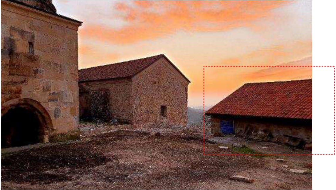
Rehabilitated Oil-mill on the right