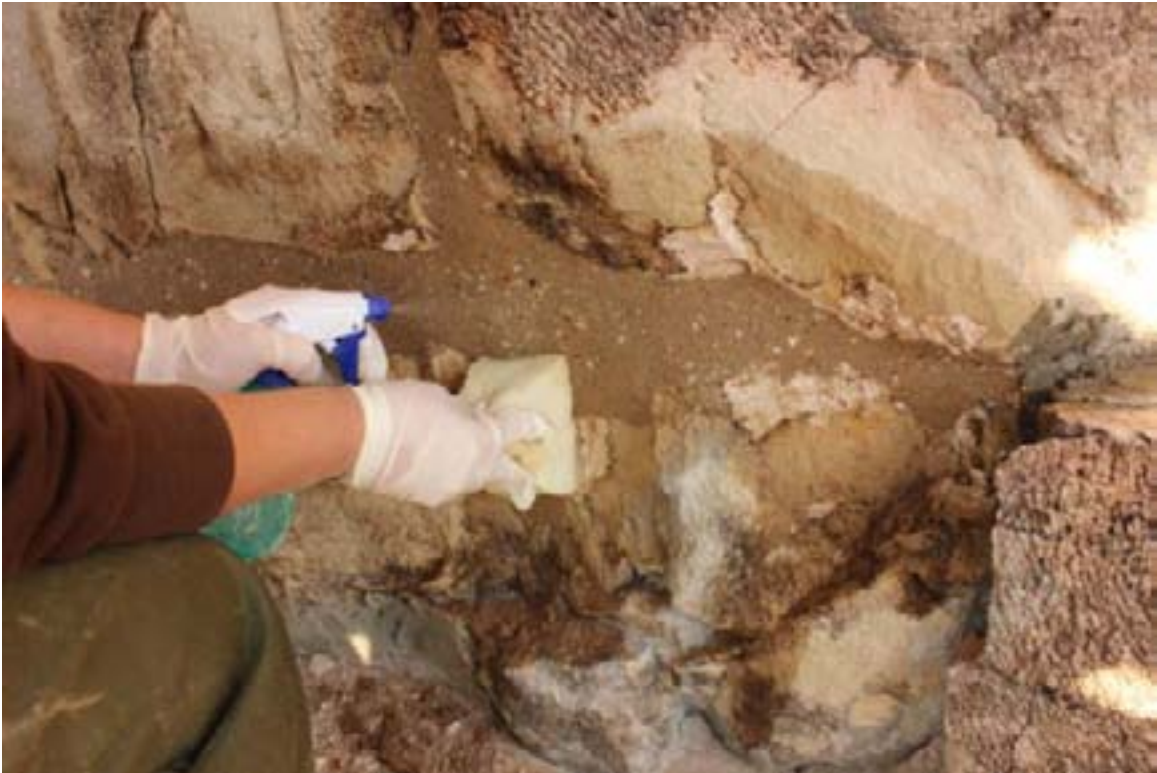
Western facade Church of the Virgin at Gelati Monastery