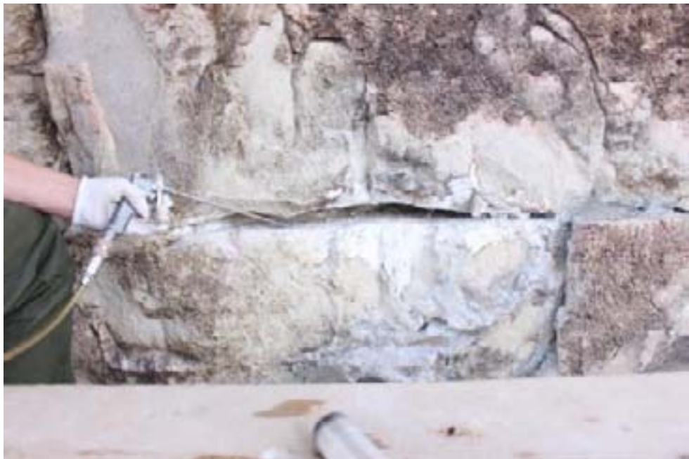
Western facade Church of the Virgin at Gelati Monastery