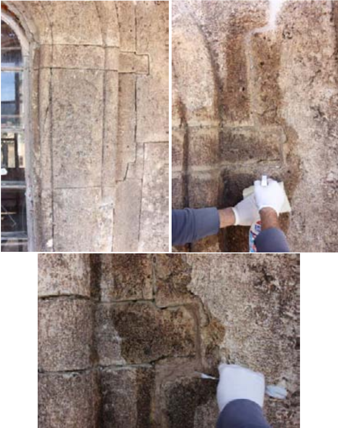
Western façade, Church of the Virgin at Gelati Monastery