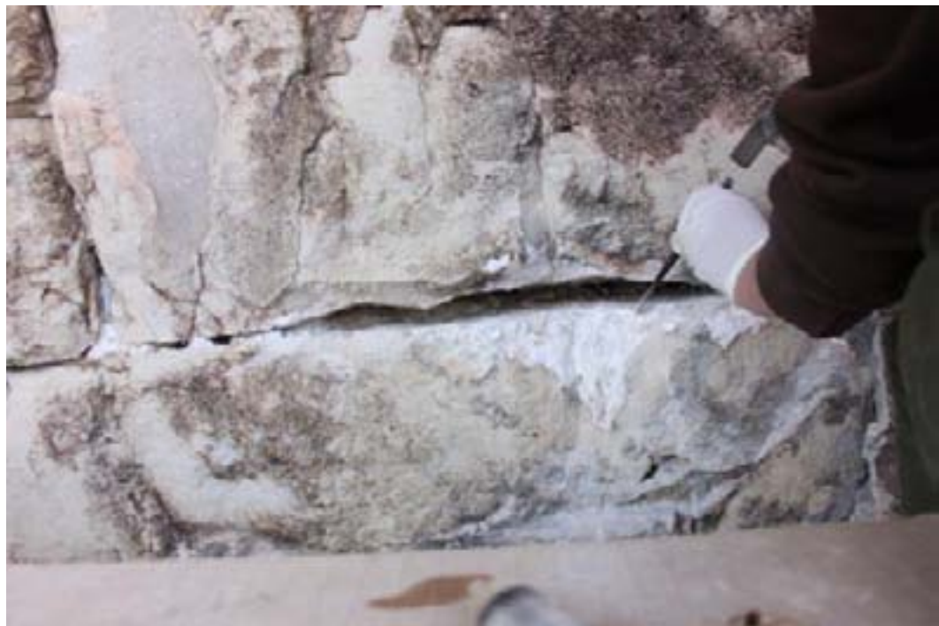
Western facade Church of the Virgin at Gelati Monastery