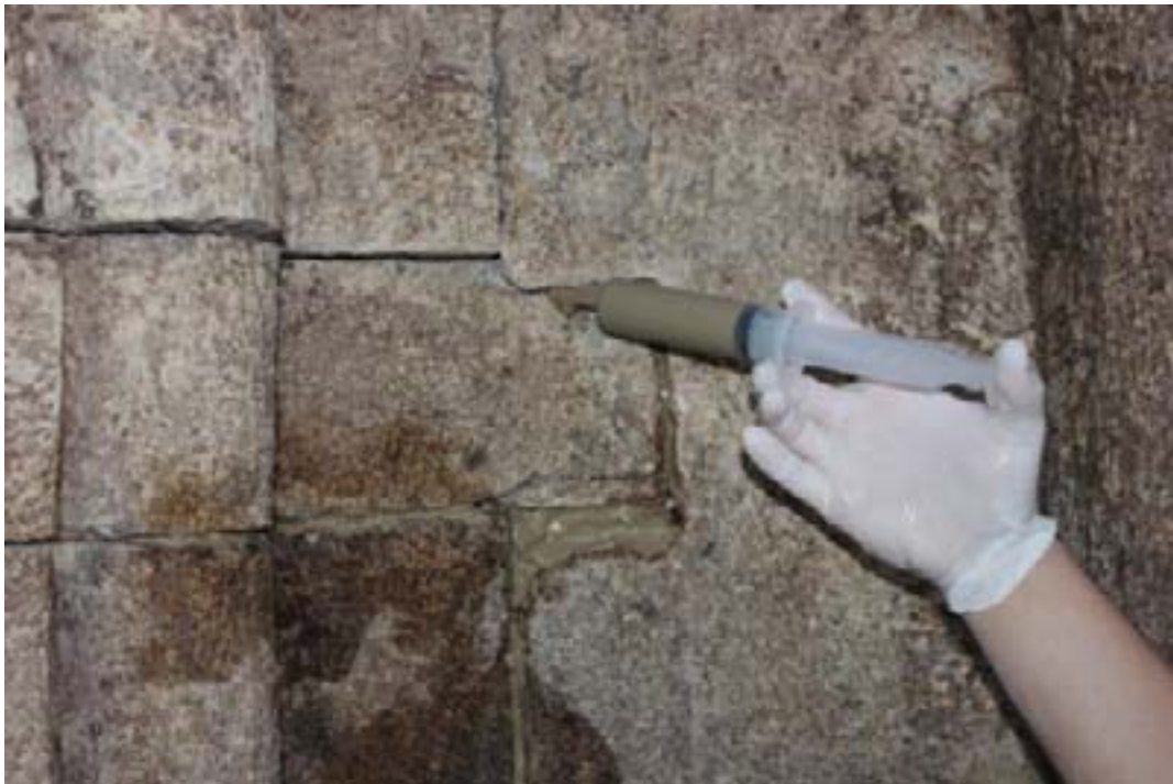
Western facade Church of the Virgin at Gelati Monastery