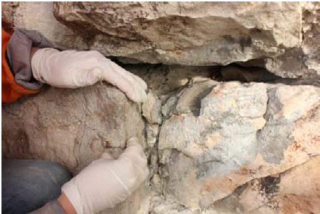
Western facade Church of the Virgin at Gelati Monastery