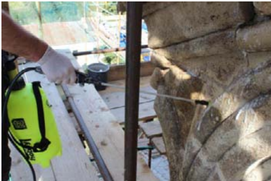
Western facade Church of the Virgin at Gelati Monastery