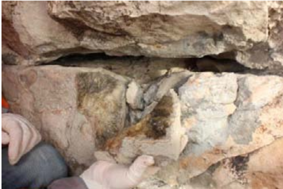
Western facade Church of the Virgin at Gelati Monastery